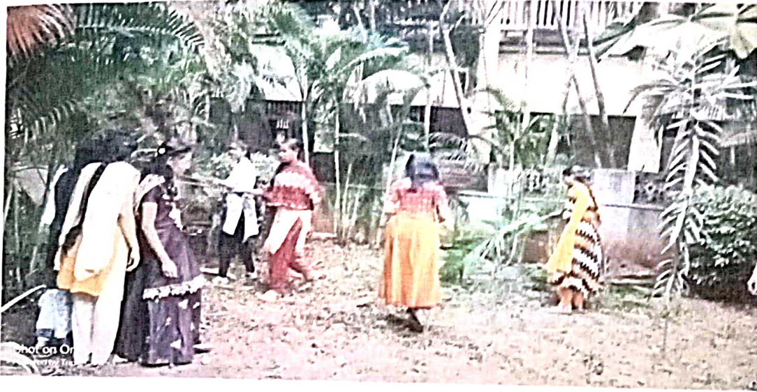
Land Preparation For Nursery Bed

Horticulture Students involved in the preparation of Nursery beds, Cleaning the Garden